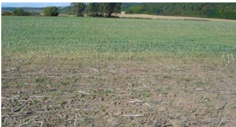
PODLOCK field demonstration – Slovakia. Foreground treated with Glyphosate 3 L/ha plus 1 L PODLOCK and Background Glyphosate 3 L/ha alone. Much higher number of volunteers from seed shed where PODLOCK not used.