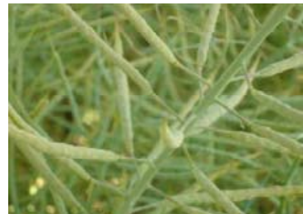
Earliest application timing: Around 3 weeks prior to harvest when the pods are light green