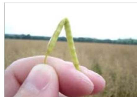
Ideal timing of application: Pods are still pliable and can be bent into a U or V shape without splitting.

Elliott Technologies Limited, PO Box 838, Pukekohe NZ